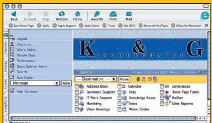
FirstClass Desktop ( web browser view ) featuring a user's Mailbox, Address Book, Calendar and Conferences (collaborative workspaces)

IMAGINE not having to rely on free Internet accounts when traveling because you cannot easily connect to your corporate email system when you are away from the office – compromising the security of your company's confidential information. Now with FirstClass you can securely access all of your important messages from your FirstClass account via the Internet by logging on to your FirstClass Desktop. In addition, you are able to listen to voice messages and access fax and email messages – all through an easy to navigate user interface – giving you a comfort level that all of your information is secure.